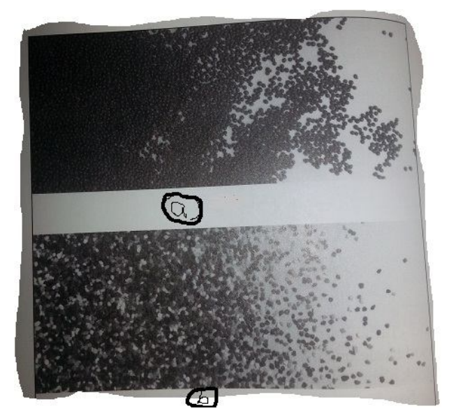
Figure 8.1: Blasting Media (a) Shot and (b) Grit

For heavy-duty cleaning, grit is used and it makes use of blasting materials called media . They are mostly made of steel (steel grit) and aluminium oxide. As opposed to other blasting materials which have spherical shapes, the blasting material, "media", has an angular shape and this makes it remove materials from the engine part surface during cleaning. It gives a good part surface for preparation for painting. It is not widely used choice for cleaning.