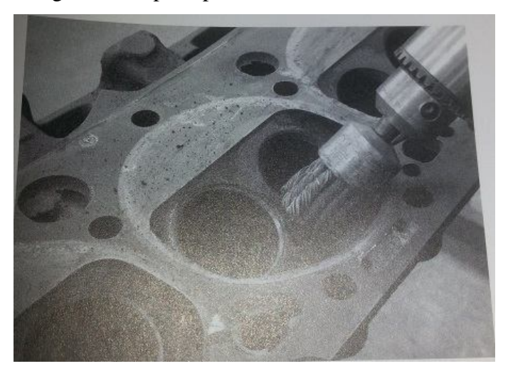
Figure 8.9: A wire brush mounted on a drill

Small wire brush can be used to remove dirt and deposits from some engine parts surfaces by fixing/fitting them to electric or air drills. Other cleaning tools are:- the plastic abrasive disc, hand-held gasket scraper, special wire wheel, etc.