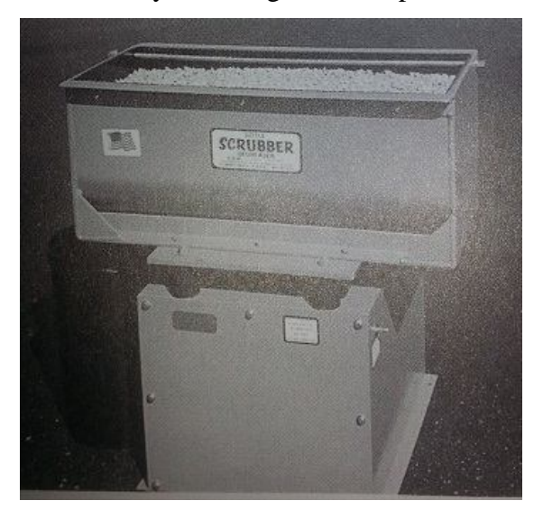
Figure 8.7: Vibratory parts cleaner

8.2.4.1 Vibratory parts cleaner: this machine cleans the engine part by causing the beads covering the engine to vibrate thereby knocking off the deposits.