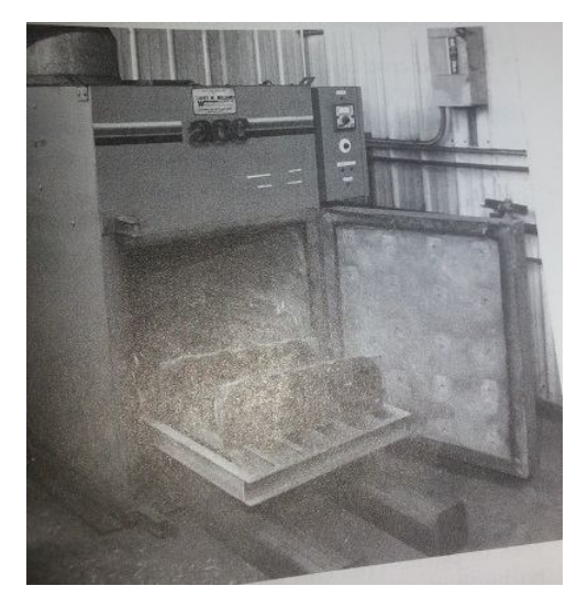
Figure 8.6: Cleaning furnace

Aluminium is cleaned at about 450 F (232 C) while ferrous metals are cleaned at about 700 F (371 C).