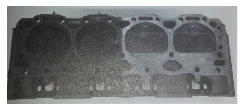
Figure 8.3: Part of a cylinder head cleaned with a glass bead blaster

The disadvantage of the use of this machine is that it requires an operator and is labour intensive.